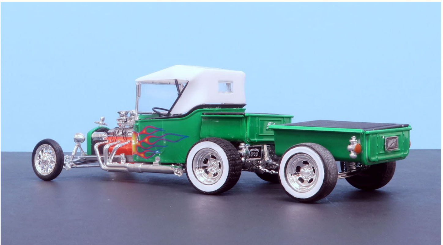
Bart Navarro: 1/24 Ford "T" Street Rod (Revell)

Bart built the model mostly OOB, but added spark plug wires. He used craft acrylic paints with clear acrylic floor polish. Decals are from the kit.