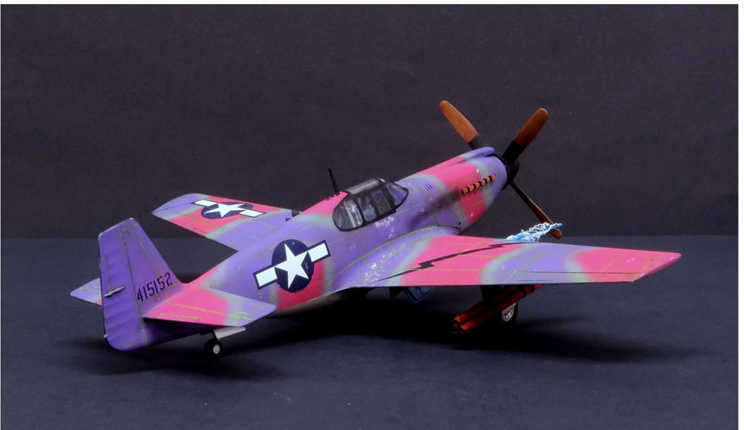
Austin Clark: 1/48 P-51 Mustang (Accurate Miniatures)

Austin built the kit mostly OOB, but added copper wire around the canon barrels to simulate lightning. Paints are Vallejo and Tamiya acrylics. The fanciful, "girl-pleasing" paint scheme was designed for Austin's daughter.