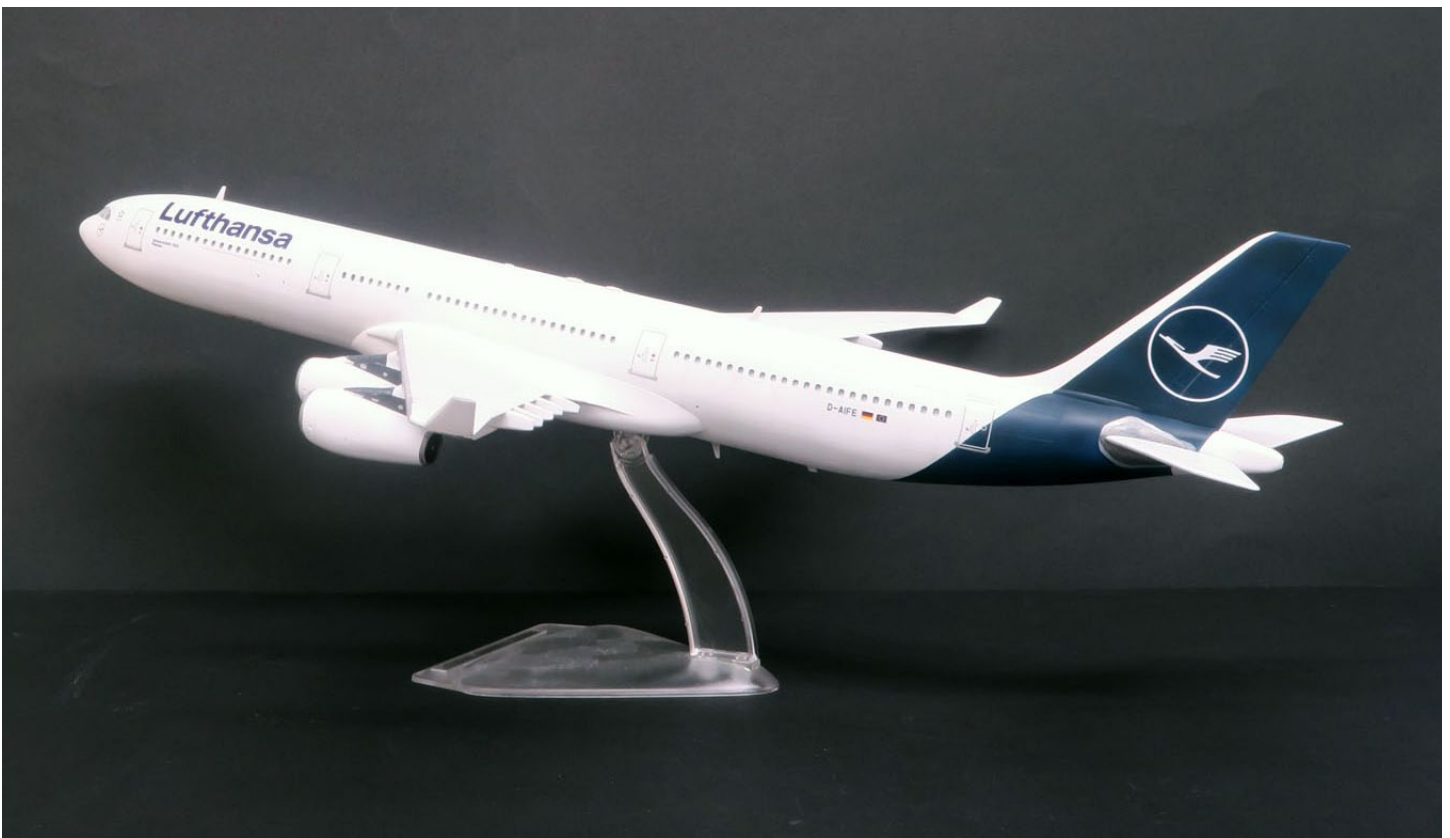
Cade Harris: 1/144 Airbus A340-300 (Revell)

Cade built the kit OOB and painted it with Tamiya laquers and Panel Line Accent. Decals are from the kit; markings are current Lufthansa livery.