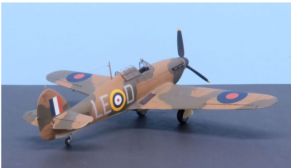
Pip Moss 1/48 Hawker Hurricane Mk. I (Airfix)

Aftermarket items include a CMK "Quick and Easy" resin seat with molded seat belts, and Eduard Brassin resin exhaust manifolds. The Airfix kit doesn't supply a pilot's mirror, but the reference photo I have clearly shows one in place. I used the mirror from a Tamiya Spitfire Mk. V kit with a small piece of sheet styrene for the mount. Paints are Mr. Color for the Interior Grey-Green and under surface Sky, AK Real Colors for the Dark Earth, and MRP for the Dark Green. I used dark gray pastel dust and Tamiya Panel Line Accent for light weathering. Decals are from an Xtradecals Battle of Britain sheet. The serials provided are incorrect for this plane, so I pieced together the numbers and letters from an Aeromaster sheet. Final clear coat is Mr. Color GX114 Smooth Flat mixed 4 or 5 to 1 with Mr. Color GX100 Gloss.