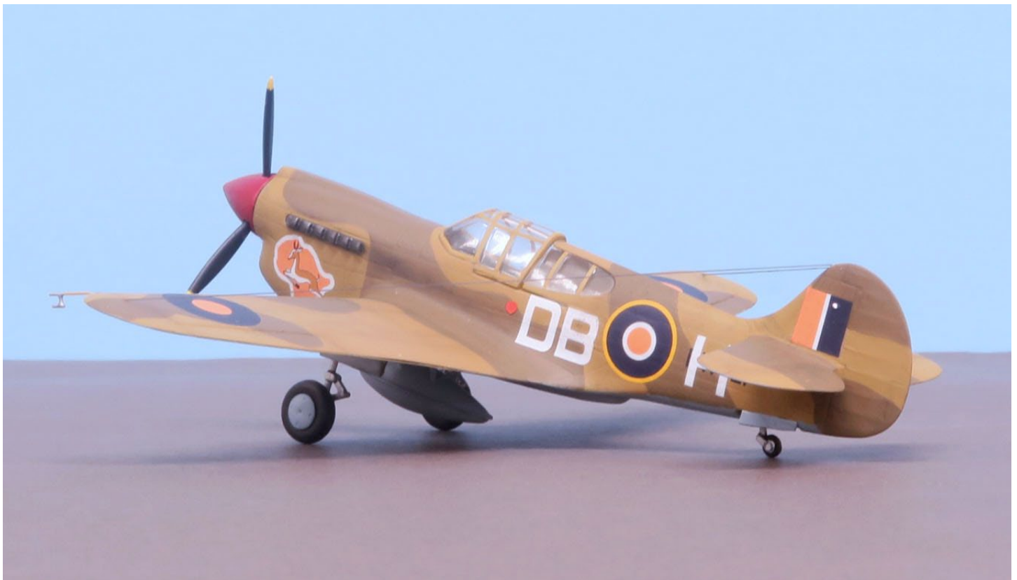
John Walker: 1/72 Kittyhawk Mk. IA (Kovozavody Semily)

John built the model OOB, but added a drop tank from a Hasegawa kit. Paints are Vallejo (Dark Earth) and Polly Scale (Middle Stone and Azure Blue) acrylics. Decals are from a Sword kit of the short tail Kittyhawk Mk. III. Markings are for RSAF No. 2 Sqn. (Flying Cheetah), North Africa, 1942. Although the plane closely resembles the Kittyhawk Mk. III (P-40K) with its enlarged vertical tail, it was actually from the last batch of Mk. 1A's, some of which incorporated features of later variants. John writes, "This is an old kit that required some TLC, but it looks like a Kittyhawk when finished."