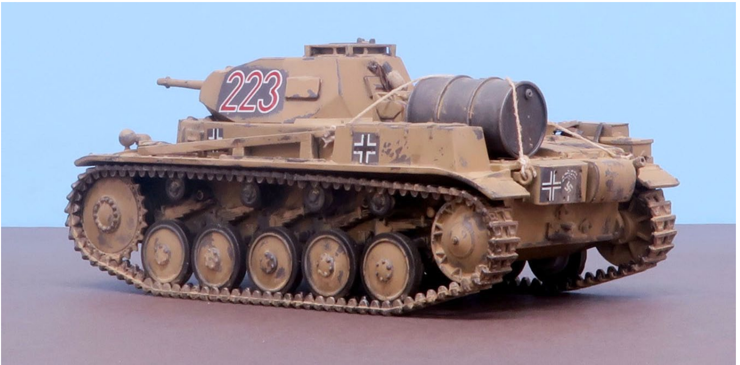
Tim Sistare: 1/35 Panzer II Ausf. F/G (Tamiya)

Tim built the kit mostly OOB, but with additional stowage. Paints are mostly Tamiya acrylics. Tim writes: "I used AK enamel products and pigments to simulate sand. The major technique I used was utilizing AK chipping fluid to expose Panzer Grey base coat under Afrika Korps Yellow. This was done by applying the fluid via airbrush in two-to-three coats. Once dry (four-plus hours) I applied the topcoat. AK recommends only one layer of paint on top but I did three of the yellow to ensure full paint coverage. I brushed water onto the areas I wanted to chip and let it sit for 5 minutes, and then by brushing vigorously with a stiff brush the chipping magic occurred. In some places I used a toothpick to scratch an opening in the paint and then proceeded to brush where I had a heavy application of the top coat. After that I added some additional chipping using paint and a fine brush.