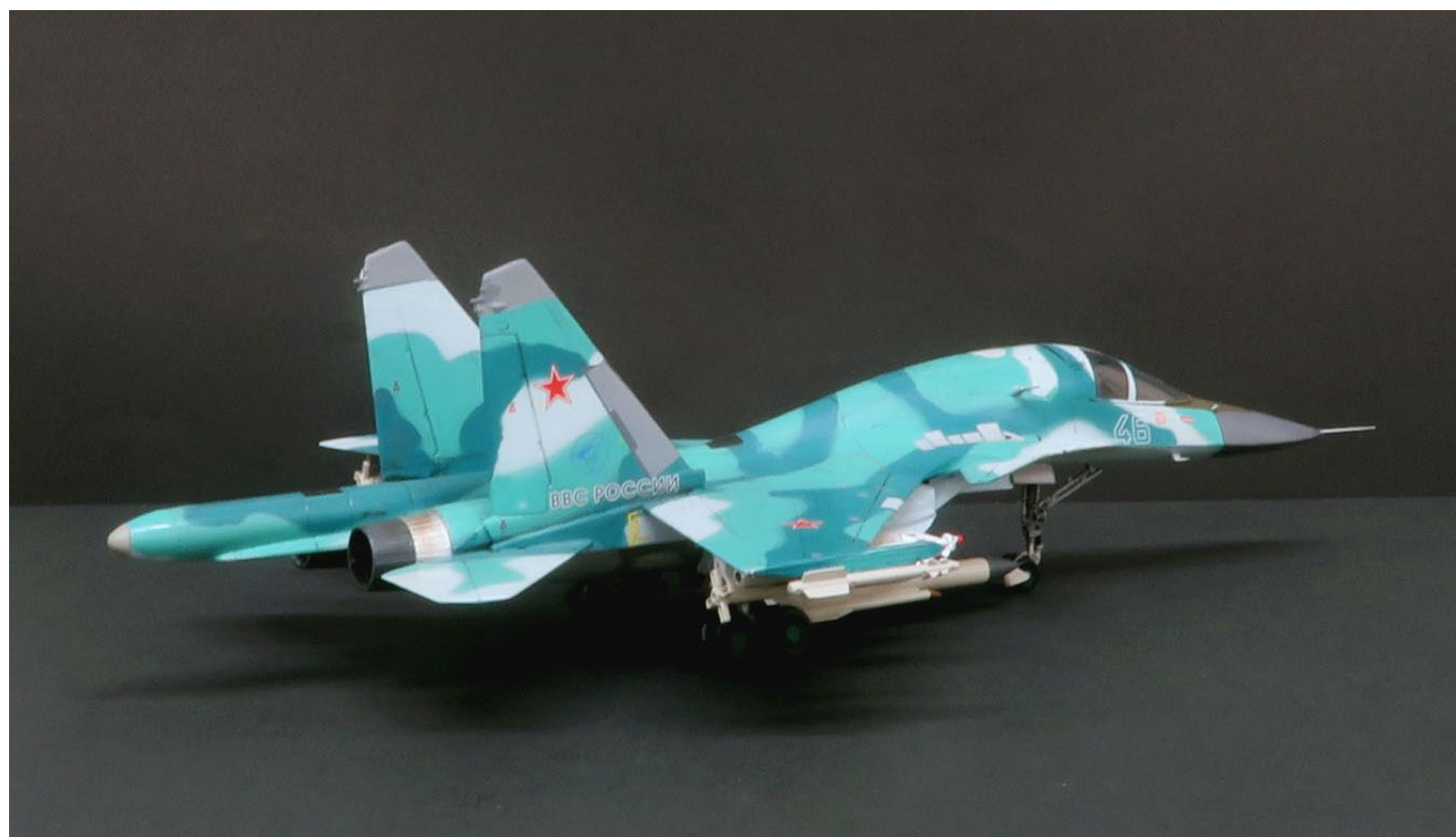
Miguel Villega: 1/48 Su-34 (Italeri)

Miguel built the model OOB and painted it with Vallejo acrylics.