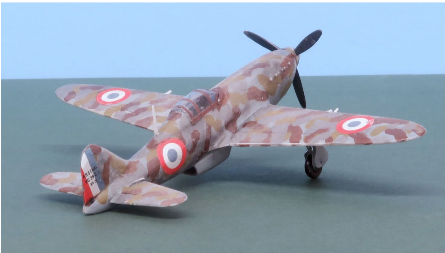
Bart Navarro: 1/72 Arsenal VG-39 (Azure)

Bart built the model OOB and painted it with Mr. Color acrylic lacquers over a Mr. Surfacer 1000 primer coat. The camouflage was hand painted. A dark wash and final dull coat were applied after the decals, which are from the kit.