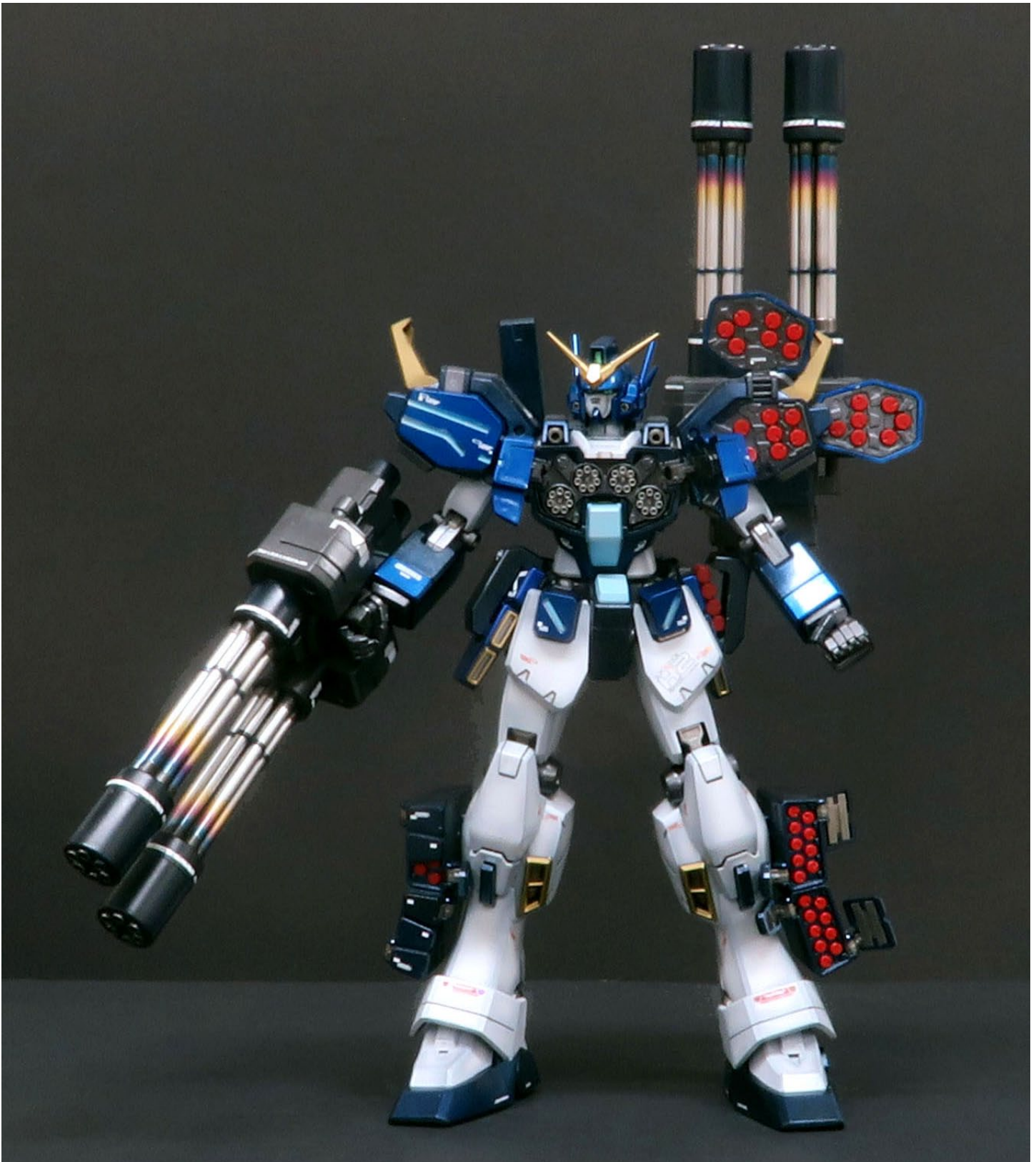
Phil Maiewski: 1/100 Gundam Heavyarms Custom EW (Bandai)

Phil did a complete airbrush repaint including candy coat metallic blue. He employed pre-shade weathering and added waterslide decals from Holo. The figure took 3rd place in the 1/100 Gundam category at Patcon 2022.