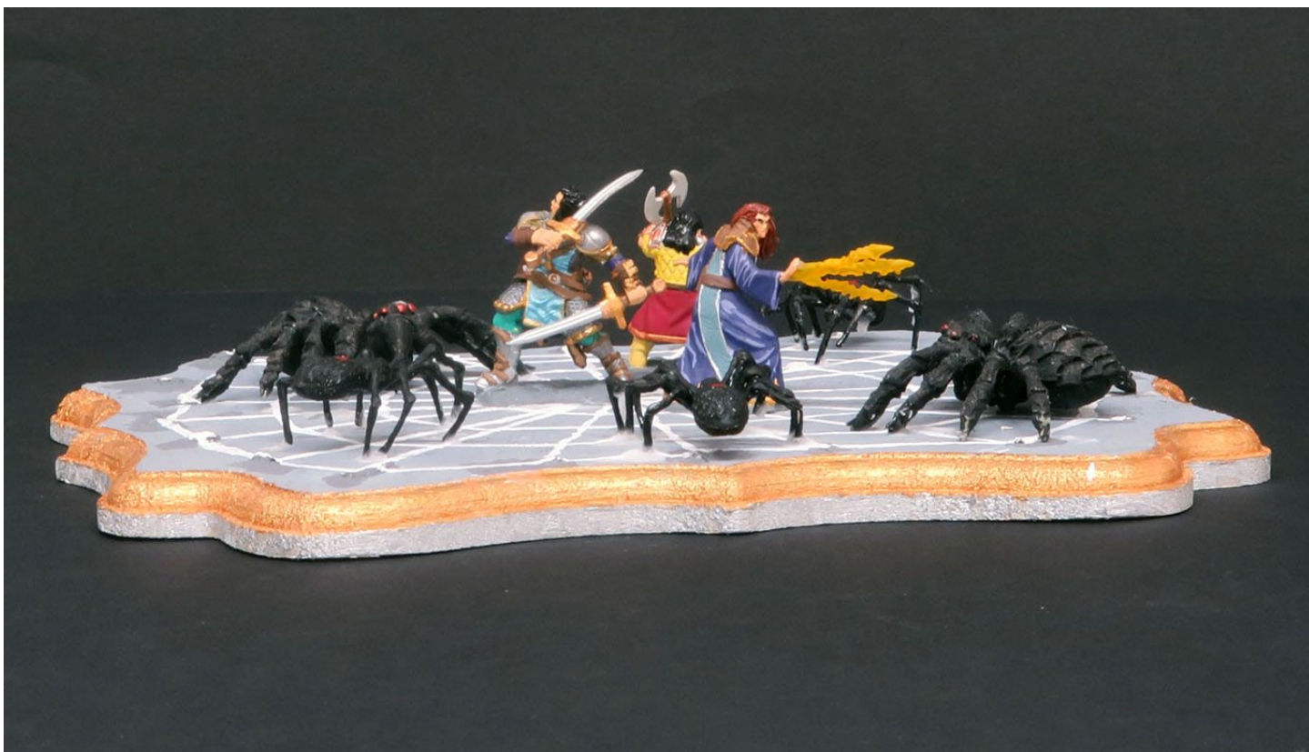
Ken Fields: 28mm DnD "Spider Attack" (WizKids)