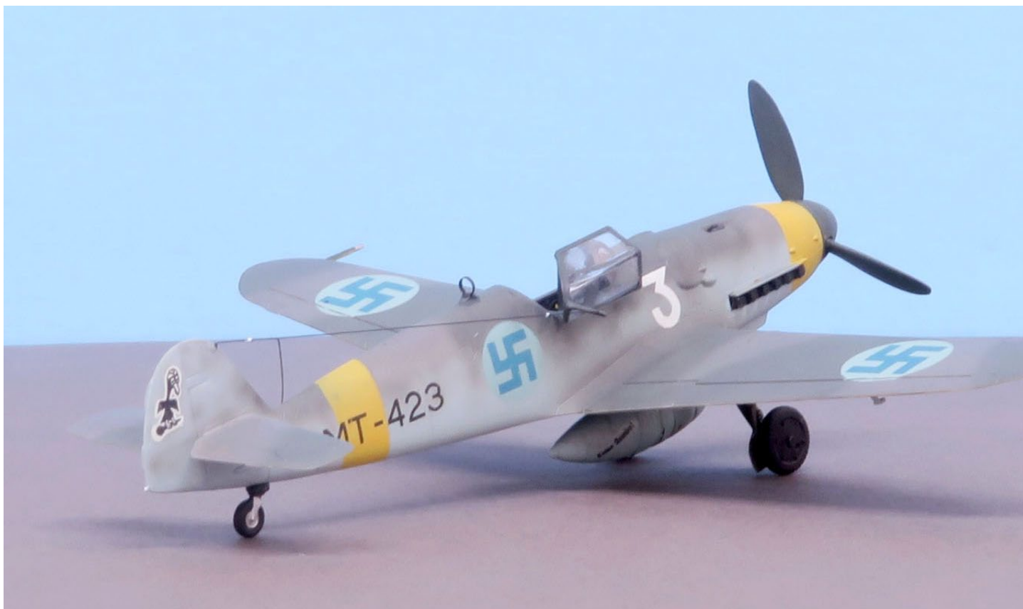
John Walker: 1/72 Bf 109 G-6 (Academy)

John built the model OOB and painted it with Vallejo acrylics. Decals are from InScale 72 sheet AC002. Markings are for Sgt. Hemmo Leino of 1/HLeLv 34, Finnish Air Force, Finland, 1943. The kit, from the Kirk collection, was actually a Bf 109 G-14, but no modifications were required to build it as a late G-6 since all the differences are internal.