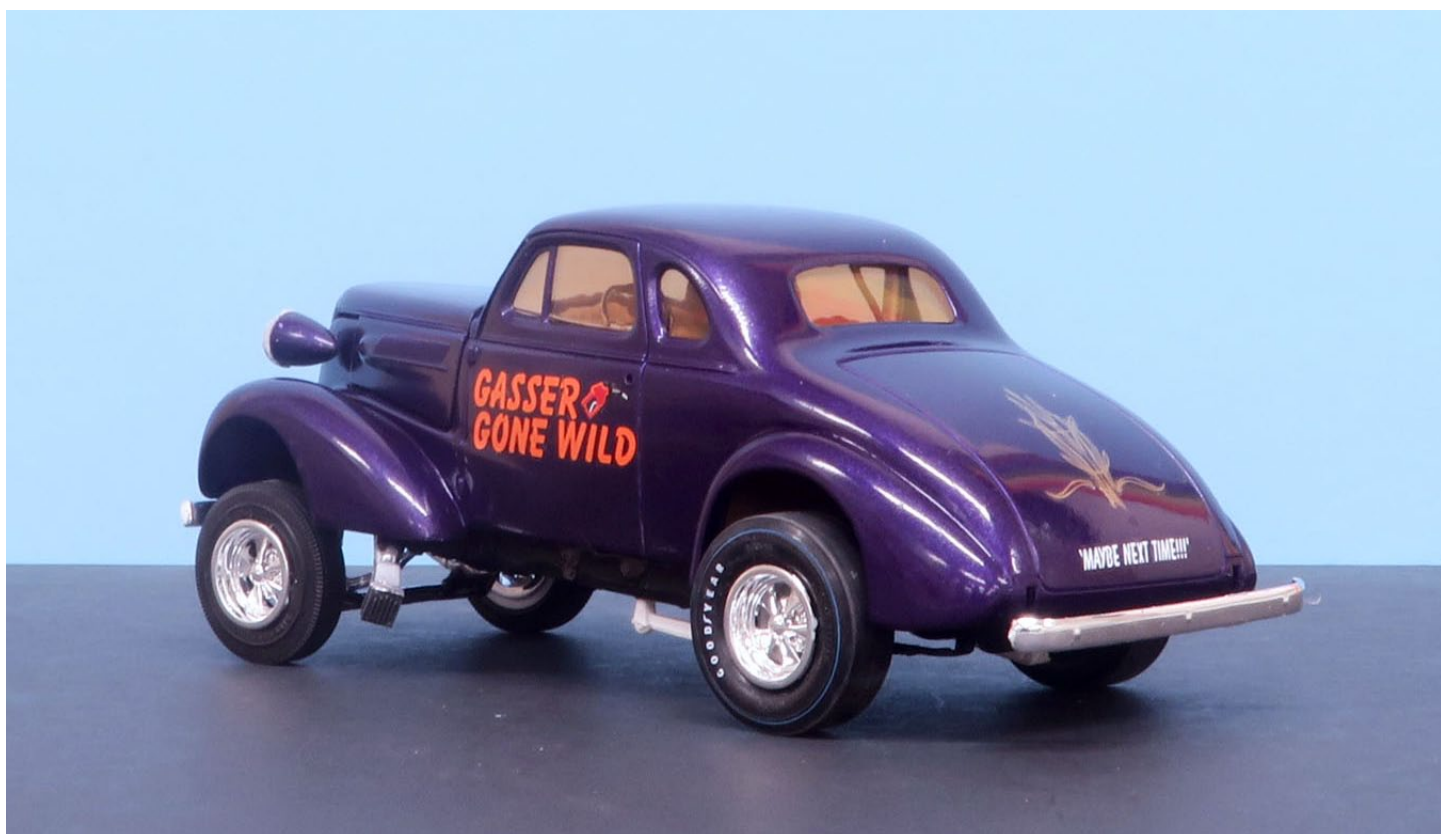
Bart Navarro: 1/25 1937 Chevy Coupe, Stovebolt Gasser (AMT)

Bart built the model mostly OOB, but added sparkplug wires. He used Mr. Surfacer 1000 as a base primer, then Testors Extreme Lacquer (rattle can) color coat, which was then buffed and polished. No clear coat was used. Decals are from Gofer since they were missing from the kit.