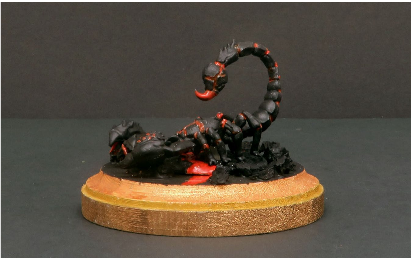
Ken Fields: 1/52 AD&D Magma Scorpion (Reaper)