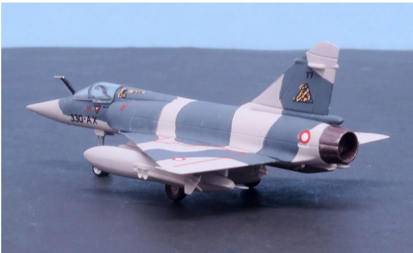
Linda Crummett: 1/144 Mirage 2000-5F (Heller)

Linda built the model OOB. For paints she used Model Master Interior Green, Tamiya light grey primer, Tamiya XF-18 Medium Blue, and Tamiya LP-20 Light Gun Metal. Decals are from the kit. Markings are for the French Armée de l'Air Escadron de Chasse 5/330 "Côte d'Argent" in 1999.