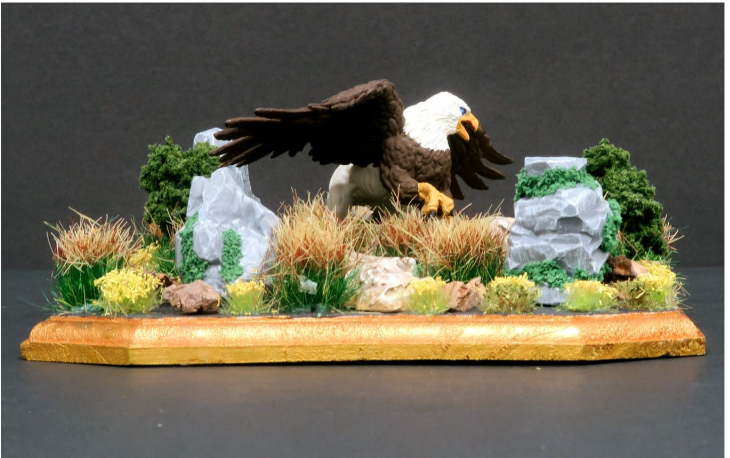
Ken Fields: 1/52 AD&D Gryphon (Reaper)