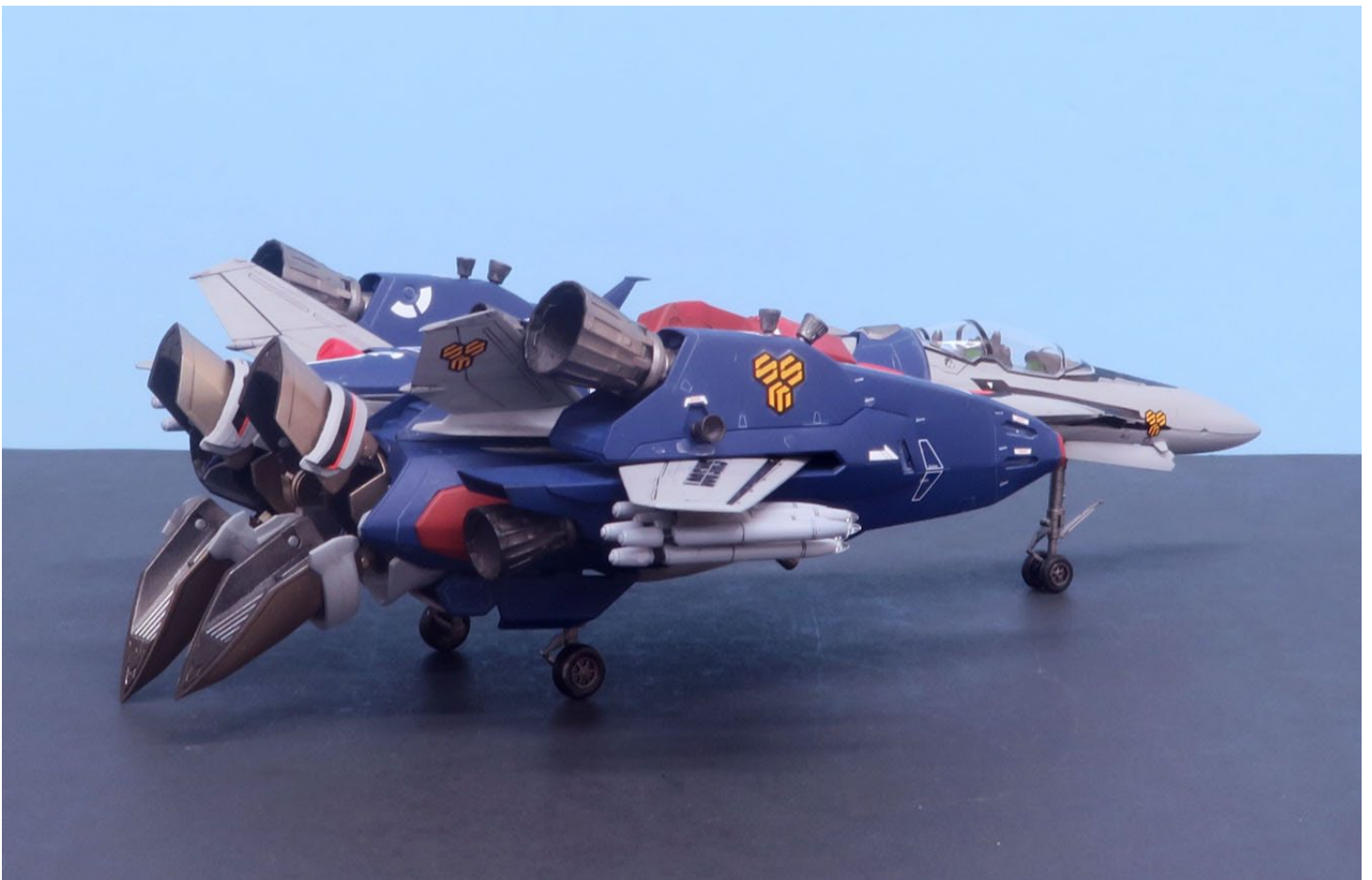
Pedro Estrada: 1/72 "Macross Zero" VF-0S (Hasegawa)