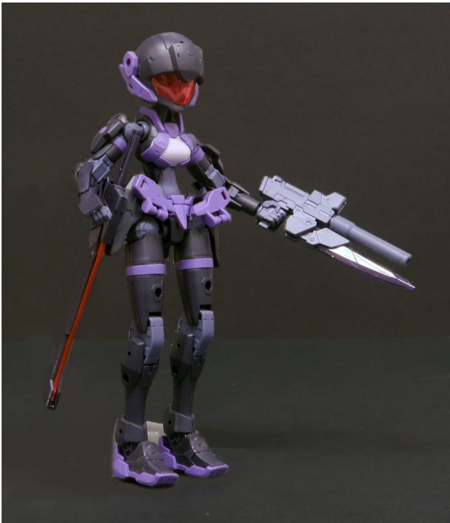
Elise Williamson: 1/144 EXM-H15 Acerby Type-E (Bandai)

Elise built this 30 Minute Missions figure OOB. ExAMACS (Extended Armament & Module Assemble & Combine System) are machines used in the three-way conflict between the Earth Alliance, Byron, and Maxion. As the name implies, ExAMACS are built around being heavily modular and compatible with alternate parts.