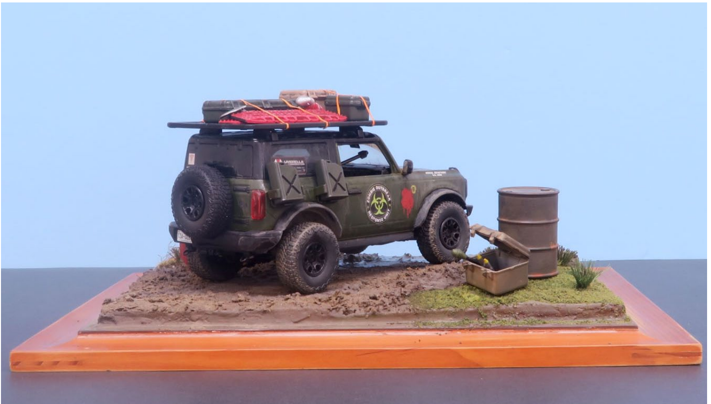
Chris Kizik: 1/25 2021 Ford Bronco (AMT)

Chris added a bunch of 1/24 scale accessories. The interior is painted with Vallejo Gray-White with black accents; the exterior is Vallejo Olive Drab with Vallejo Dust/Mud Effects. Chris used 1/24 scale automotive- and 1/35 scale US Army decals. Chris writes, "This Bronco was made to depict a post-apocalyptic medic aid. It's fun to turn a normal kit into something else."