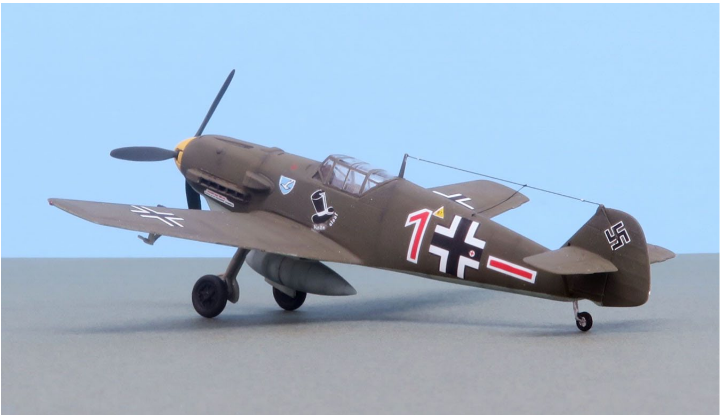
John Walker: 1/72 Bf 109 E-1 (Hobby Boss)

John built the model OOB and painted it with AK Interactive acrylics with weathering using pastels and pencil lead. Decals are from a Super-scale sheet (72-671); markings are for 5./JG 77 "Herz As" (Ace of Hearts), Western Front, September 1939. The pilot of this plane was credited with shooting down the first British aircraft of WW2 on September 4, 1939.