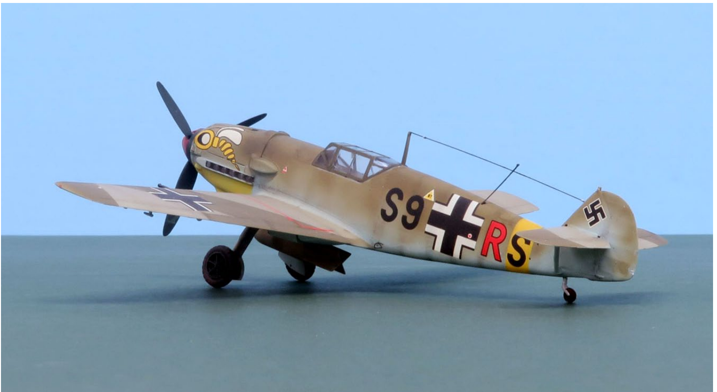
John Walker: 1/72 Bf 109 E-4/B (Hasegawa)

John built the model OOB. Paints are Vallejo Model Air acrylics with weathering using pastels and pencil lead. Decals are from the kit; markings are for 8./ZG 1, Western Europe, 1940. The E-4/B was a fighter-bomber version fitted with an ETC 500 bomb rack, carrying either one 250 kg bomb or four 50 kg bombs. Of the 561 E-4s produced, 211 were configured as E-4Bs.