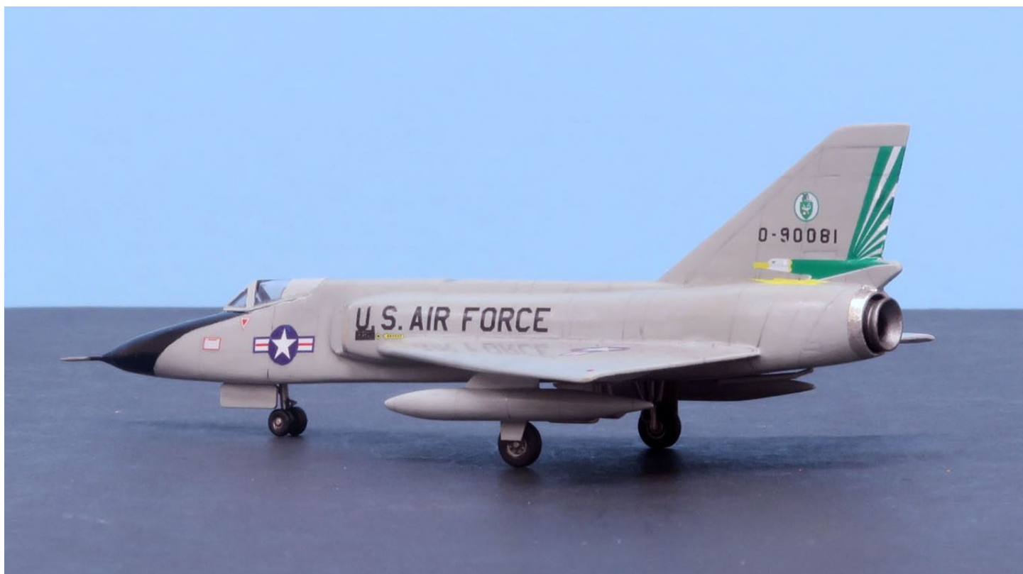
Kurt Kunze: 1/144 Convair F-106A Delta Dart (Revell)

Kurt filled in the missile bay using sheet styrene. Paints are Gunze. Decals are from Star Fighter. Markings are for the 49th FIS, Griffiss AFB, Rome, NY. The 49th FIS flew F-106s from 1968 until 1987 and were the last air defense unit to operate the Delta Dart.