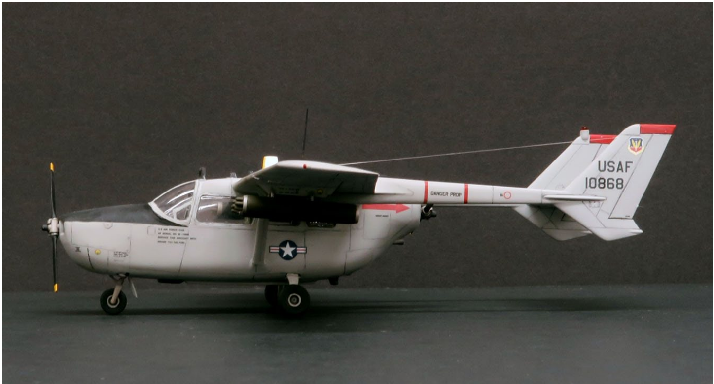
Kurt Kunze: 1/48 O-2A Skymaster (ICM)

Kurt built the kit OOB with the exception of photo-etched seat belts from True Details. Paints are Tamiya acrylics; decals are from the kit. Kurt writes, "I had to look up the tail number as the kit provided no information on the decal options. What I found for AF 68-10868 is that it served with the 4410th Combat Screw Training Wing, and that it's currently owned by East Coast Aero Tech and based at Hanscom AFB."