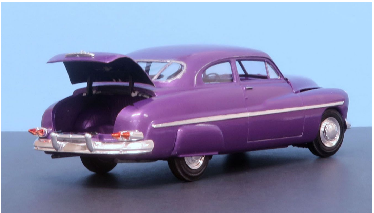
Bart Navarro: 1/25 1949 Mercury Coupe (AMT)

Bart added custom parts provided by the kit. Lowered front and back wheels. Open trunk with spare tire. Rolled front and rear pans. Bart added the skirts. Custom wheels are from the parts box. The model was painted with Kaleido water base paint and clear varnish.