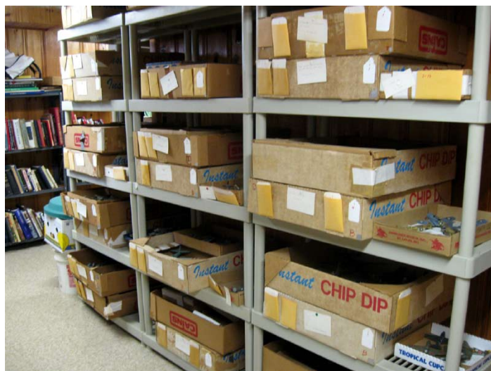
a small portion of the model collection

The collection of completed models, which by my quick count numbers at least 450, lives in corrugated boxes which take up several units of utility shelving. Other shelves house books and research materials.