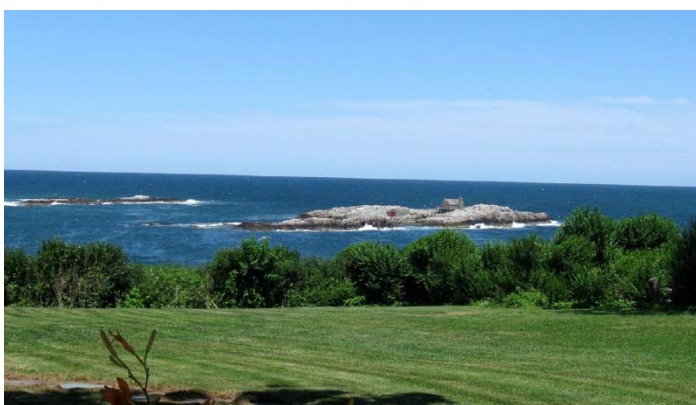
view from the front door

At first glance, Steve's modeling area appears dusty and a bit cluttered; but as one looks more closely, one is struck by the level of organization. The workbench, which looks as if it's been there forever, is covered with, and surrounded by, bins and trays full of paints, glues and other materials, as well as cardboard tubes full of brushes, knives and pencils. Magnifier, hair dryer, paper towels and various tools are all within easy reach. Alice told me she remembered her father being a stickler for having everything in its proper place.