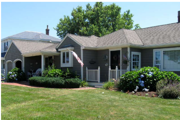
the McDonough house