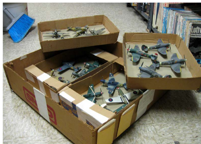
one of Steve's custom-made box complexes

Steve designed and created all the storage boxes from large cartons by cutting them down and adding horizontal pieces to allow them to be stacked. Inside many of the boxes one finds smaller ones, which can also be stacked, so that one box complex may contain up to around 25 models. Each box is marked either B or T (Bottom or Top); the B boxes may have other ones stacked on top of them.